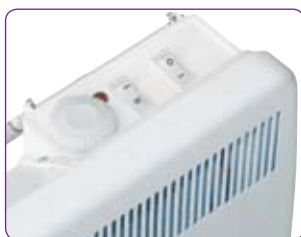
TPRIII M mechanical thermostat (all ratings).