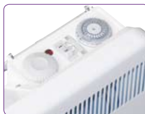
TPRIII MT7 mechanical thermostat with 7day timer (2kW model only).