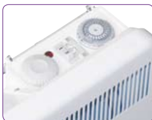
TPRIII MT mechanical thermostat and 24hr timer (all ratings).